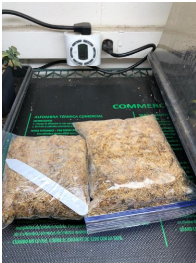
Example plastic bag seed germination.

Using “ Plastic Bag Method ” seeds are blanketed in damp sphagnum moss and germinated in zipper-type, resealable plastic bags. Thoroughly saturate the sphagnum moss with water and wring it until no more can be expressed. Place the seeds and the sphagnum moss inside the plastic bags (along with a label) and keep the bags at 26-35°C. The bags may need to be flipped so that both sides receive an even amount of heat exposure.