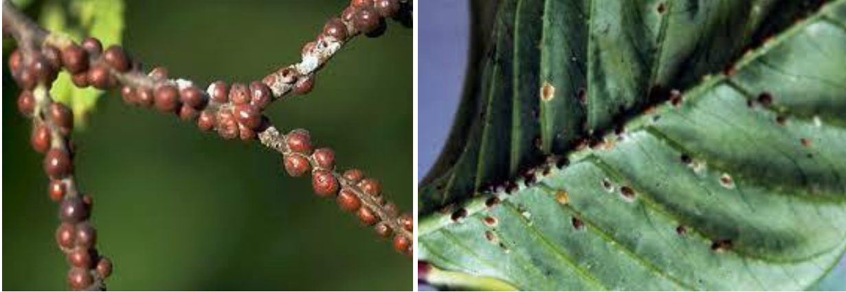
Figure 8. Scale insects on stem and Scale insects on the underside of leaf.

The scale insects are small insects of the order Hemiptera, suborder Sternorrhyncha. Most scale insects are parasites of plants, feeding on sap drawn directly from the plant's vascular system. Many scale species are serious crop pests. The waxy covering of many species of scale insects protects them effectively from contact insecticides, which are only effective against the first-instar nymph stage known as the crawler. However, scales often are controlled by use of horticultural oils, that suffocate them, systemic pesticides that poison the sap of the host plants, or by biological control agents such as tiny parasitoid wasps and Coccinellid beetles. Insecticidal soap may also be used against scales. ( https://en.wikipedia.org/wiki/Scale_insect )