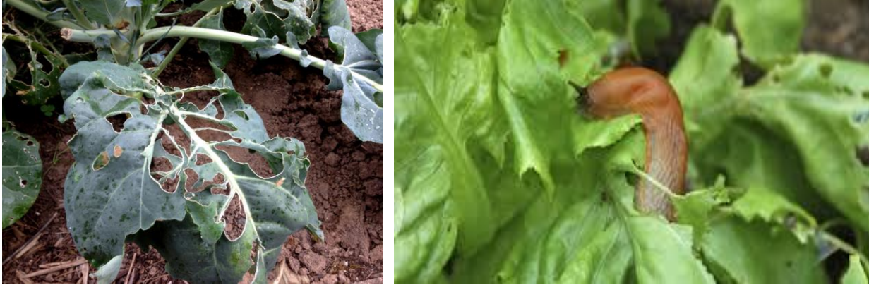
Figure 7. Slug damage on cabbage and a Slug eating Lettuce.

Slug, or land slug, is a common name for any apparently shell-less terrestrial gastropod mollusc. The word slug is also often used as part of the common name of any gastropod mollusc that has no shell. The shell-less condition has arisen many times independently during the evolutionary past, and thus the category "slug" is a polyphyletic one.