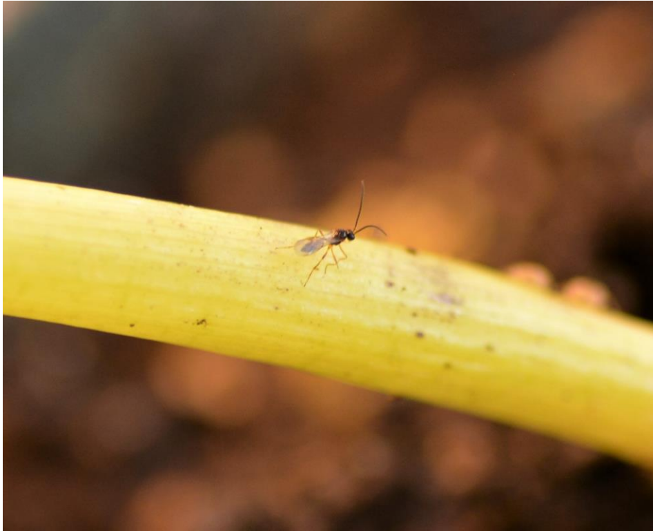
Figure 2. Fungus Gnat on an Eichhornia spp. leaf.

Fungus gnats are small, dark, short-lived gnats, of the families Sciaridae, Diadocidiidae, Ditomyiidae, Keroplatidae, Bolitophilidae, and Mycetophilidae (order Diptera); they comprise six of the seven families placed in the superfamily Sciaroidea. The larvae of most species feed on fungi growing on soil, helping in the decomposition of organic matter.