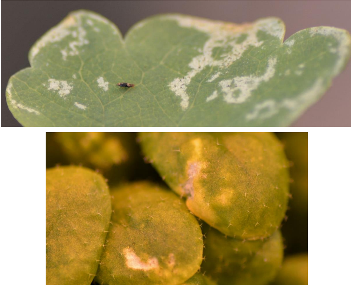
Figure 3. Close up of Thrips and leaf damaged by Thrip feeding.

Thrips (order Thysanoptera) are minute (most are 1 mm long or less), slender insects with fringed wings and unique asymmetrical mouthparts. Different thrips species feed mostly on plants by puncturing and sucking up the contents, although a few are predators. Many thrips species are pests of commercially important crops. A few species serve as vectors for over 20 viruses that cause plant disease, especially the Tospoviruses. In the right conditions, such as in greenhouses, many species can exponentially increase in population size and form large swarms because of a lack of natural predators coupled with their ability to reproduce asexually