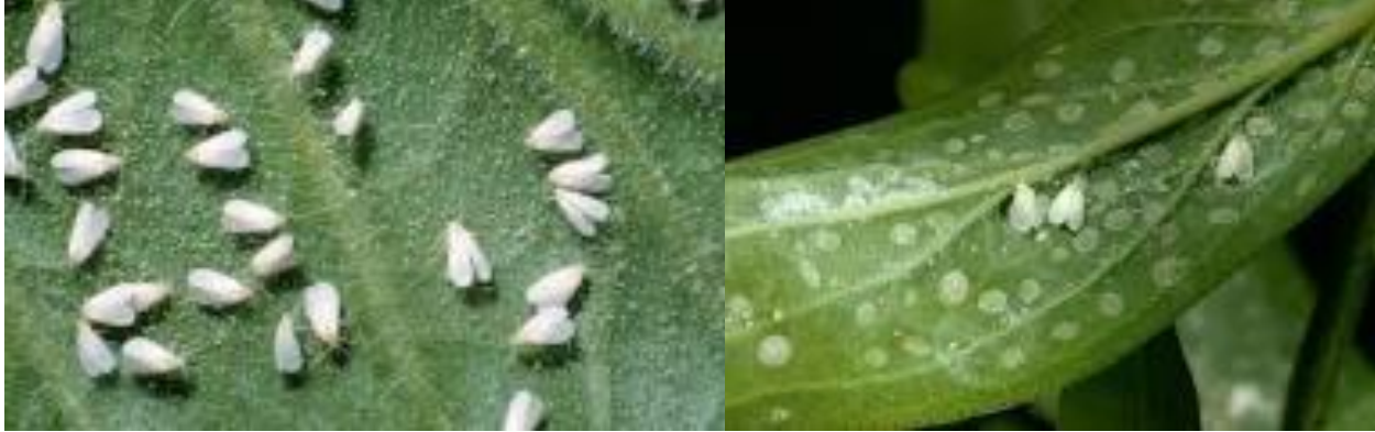
Figure 5. Whitefly Trialeurodes adults & eggs.

Trialeurodes vaporariorum , commonly known as the glasshouse whitefly or greenhouse whitefly, is an insect that inhabits the world's temperate regions. Like various other whiteflies, it is a primary insect pest of many fruit, vegetable and ornamental crops. It is frequently found in glasshouses (greenhouses), polytunnels, and other protected horticultural environments. Adults are 1–2 mm in length, with yellowish bodies and four wax-coated wings held near parallel to the leaf surface. ( https://en.wikipedia.org/wiki/Greenhouse_whitefly )