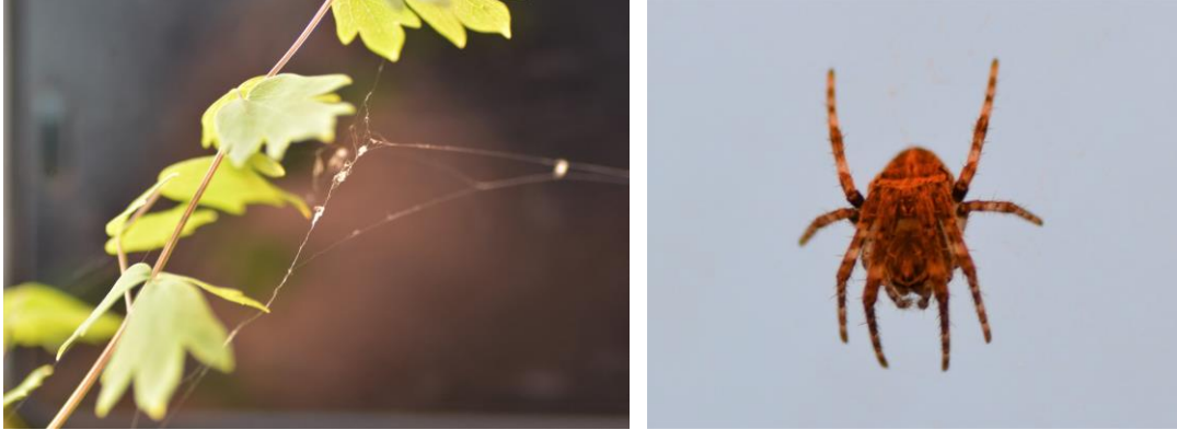
Figure 6. Spider mites in webbing Spider mite adults.

Spider mites are members of the Acari (mite) family Tetranychidae, which includes about 1,200 species.[1] They generally live on the undersides of leaves of plants, where they may spin protective silk webs, and they can cause damage by puncturing the plant cells to feed.[2] Spider mites are known to feed on several hundred species of plants. ( https://en.wikipedia.org/wiki/Spider_mite )