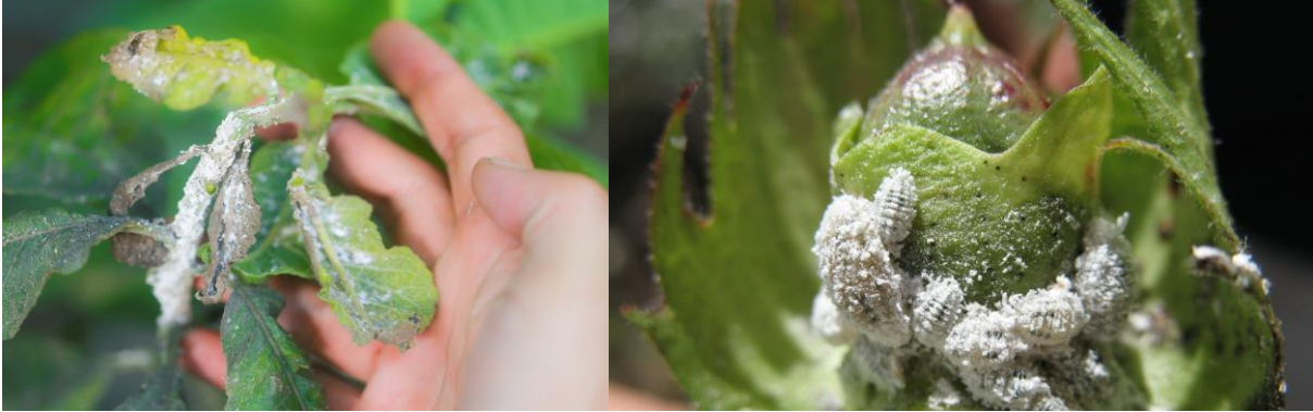
Figure 4. Mealybugs on coffee and cotton.

Mealybugs are insects in the family Pseudococcidae, unarmored scale insects found in moist, warm climates. Many species are considered pests as they feed on plant juices of greenhouse plants, house plants and subtropical trees and also act as a vector for several plant diseases. ( https://en.wikipedia.org/wiki/Mealybug )