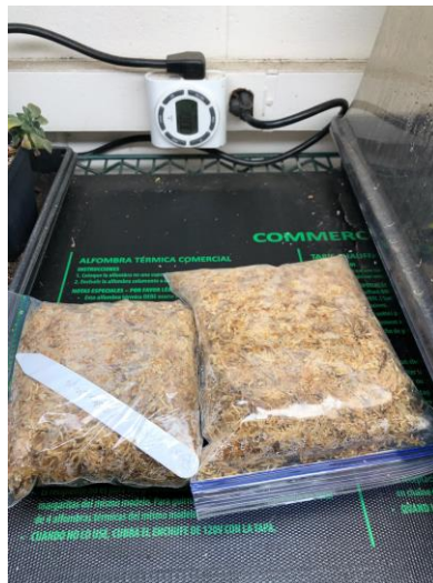
Example plastic bag seed germination.

Using “ Plastic Bag Method ” seeds are blanketed in damp sphagnum moss and germinated in zipper-type, resealable plastic bags. Thoroughly saturate the sphagnum moss with water and wring it until no more can be expressed. Place the seeds and the sphagnum moss inside the plastic bags (along with a label) and keep the bags at 26-35°C. The bags may need to be flipped so that both sides receive an even amount of heat exposure.