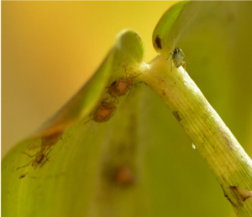
Figure 1. Aphids with piercing mouth parts on an Eichhornia spp. leaf.

Aphids are small sap-sucking insects and members of the superfamily Aphidoidea. A typical life cycle involves flightless females giving living birth to female nymphs without the involvement of males. Maturing rapidly, females breed profusely so that the number of these insects multiplies quickly. Winged females may develop later in the season, allowing the insects to colonise new plants. Aphids are among the most destructive insect pests on cultivated plants in temperate regions. In addition to weakening the plant by sucking sap, they act as vectors for plant viruses and disfigure ornamental plants with deposits of honeydew and the subsequent growth of sooty moulds. Insecticides do not always produce reliable results, given resistance to several classes of insecticide and the fact that aphids often feed on the undersides of leaves. On a garden scale, water jets and soap sprays are quite effective. Natural enemies include predatory ladybugs, hoverfly larvae, parasitic wasps, aphid midge larvae, crab spiders, lacewing larvae, and entomopathogenic fungi. ( https://en.wikipedia.org/wiki/Aphid )